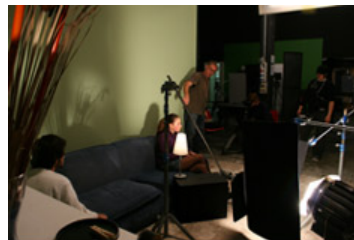
Dancing with Light black-and-white workshop

"The technique addresses the technical and creative aspects of cinematic expression and expands them into Ansel Adams' method of Zone System and Pre-visualisation. The Zone System of Exposure is a foundation of the technique; an imperative element in the process of translating imagined values of grey into the language of film," he continues. "It is a systematic and logical approach to the realisation of the creative process and is an invaluable tool for directors and directors of photography in their pursuit of self-expression."