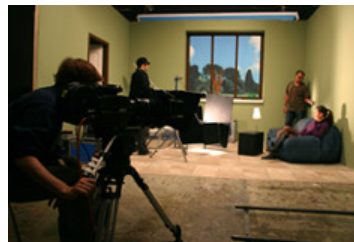
Dancing with Light black-and-white workshop